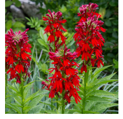
Lobelia cardinalis cardinal flower