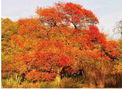
Nyssa sylvatica tupelo