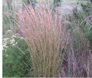
Andropogon virginicus broomsedge