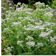
Eupatorium perfoliatum boneset