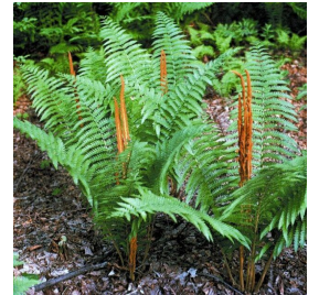
Osmunda cinnamomea cinnamon fern