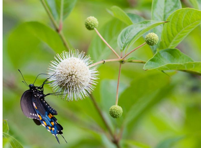
Cephalanthus occidentalis button bush