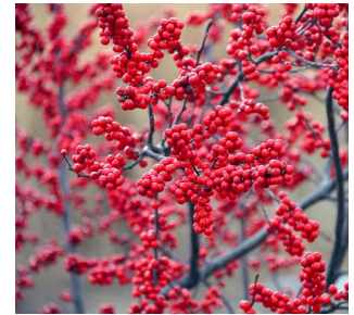
Ilex verticillata winterberry