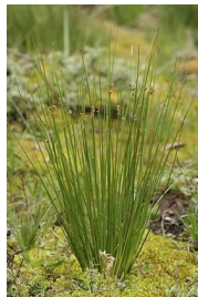
Juncus effusus soft rush