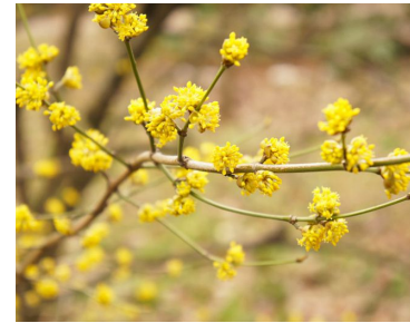
Lindera benzoin spicebush