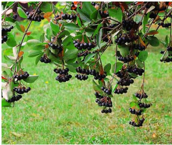
Aronia melanocarpa black chokecherry