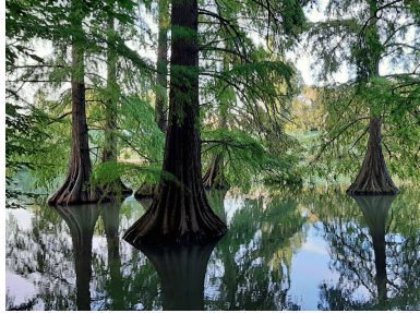
Taxodium distichum bald cypress