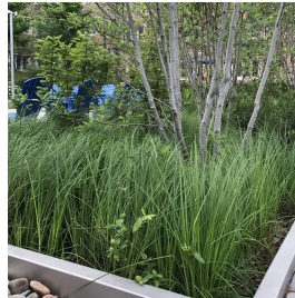
Carex stricta tussock sedge