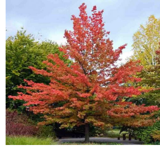
Quercus palustris pin oak