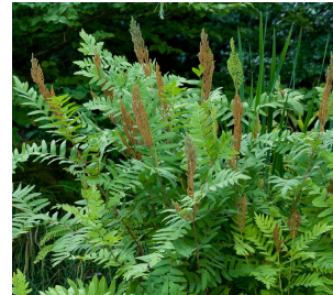
Osmunda regalis royal fern