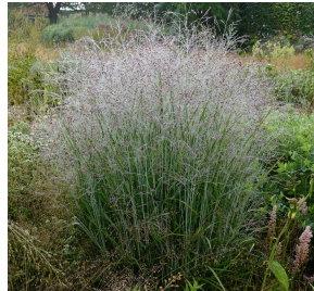
Panicum virgatum switch grass