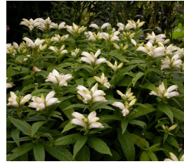
Chelone glabra turtlehead