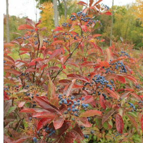
Viburnum nudum possumhaw viburnum