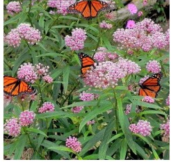
Asclepias incarnata swamp milkweed