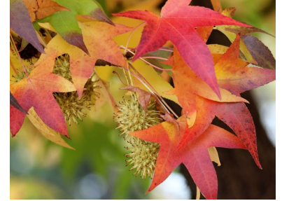
Liquidambar styraciflua sweetgum