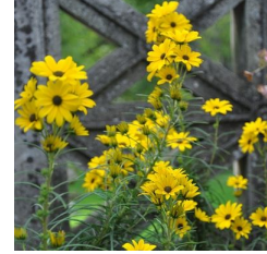
Helianthus angustifolius swamp sunflower